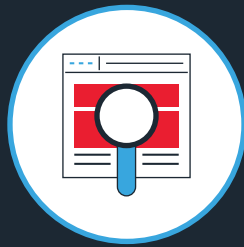
COMMONLOOK CLARITY PDF Accessibility Monitor and Tracker