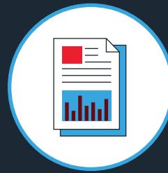
COMMONLOOK OFFICE Microsoft to Accessible PDF Creator