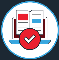
COMMONLOOK PDF VALIDATOR Free PDF Accessibility Checker

Do it yourself, have us do it or use a hybrid approach