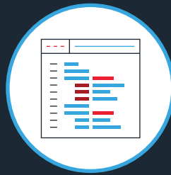
COMMONLOOK PDF Accessibility/ Remediation Software