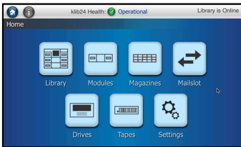
Figure 1. StorageTek SL150 Modular Tape Library Touchscreen Operator Panel