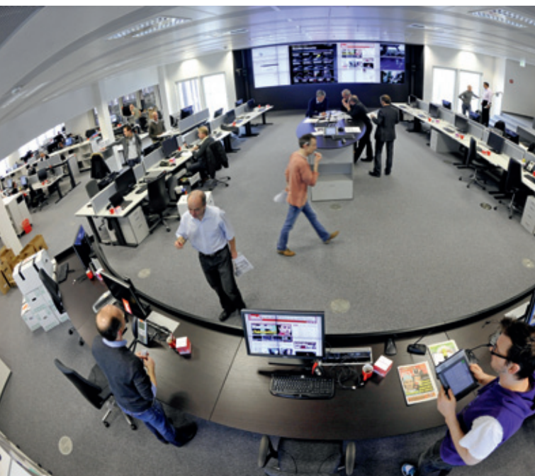
Newsroom at Ringier AG

For many years, Ringier optimized its output workflow with the MadeToPrint Auto version, operating on seven computers. Due to its scalability and speed, the decision was made to upgrade to the server version of MadeToPrint recently. “The increase in productivity in comparison to MadeToPrint Auto is roughly 30 minutes